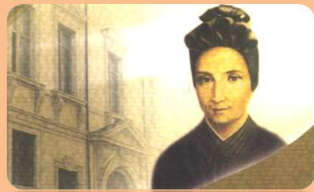
St. Magdalene of Canossa Foundress, Canossian Daughters and Sons of Charity

Communicating, Celebrating, Creating 1808-2008 Communities of Life and Love