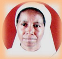
Sister Celete del Carvalho

Italian Missionary Killed in East Timor September 25, 1999 while on a mission of mercy.