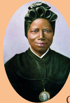
St. Josephine Bakhita 1869 – 1947 Beatified 1992 Canonized 2000