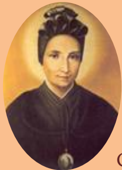
St. Magdalene of Canossa 1774-1835 Beatified 1941 Canonized 1988